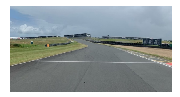
The RED FLAG CONTROL LINE is situated at Grid 11.

The white SAFETY CAR CONTROL LINE is situated after Turn 10.